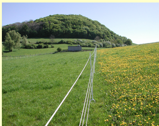
Fig. 2: Main plots differing in diversity (2007).